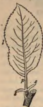
Fig. 6. A LEAF AND ITS PARTS.

So is it also with plants in some of their most unusual aspects. The strange features in animals and plants are in reality but the altered